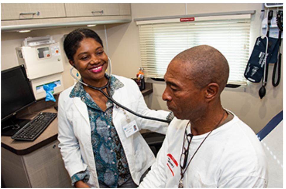
The C. L. Brumback Primary Care Clinics' new mobile health clinic is traveling throughout the county to deliver quality care. On November 16<sup>th</sup>, the clinic on wheels participated in the Homeless Coalition's Project Homeless Connect event in Boynton Beach. There the medical staff treated 10 patients, signed up several other attendees for health coverage and TOP linked them to local resources. The following day in Belle Glade, the mobile