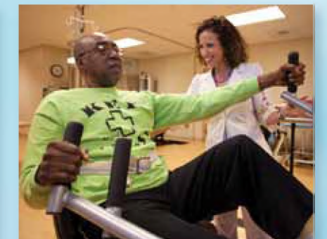
Giving residents healing and hope: physical therapy on new equipment.

In the spring of 2013, the Health Care District proudly opened the doors of its new 120-bed Edward J. Healey Rehabilitation and Nursing Center in Riviera Beach. The new center replaces a facility that had been providing care for more than fifty years. The only facility of its kind in Palm Beach County, the Healey Center provides long-term and short-term skilled nursing and rehabilitation to residents who require 24-hour-a-day care as a result of debilitating illnesses or traumatic injuries, such as strokes, brain injuries, and spinal cord injuries. The Healey Center is named after the late Florida Representative Edward J. Healey, who also served on the Health Care District Board from 1992 to 2001.