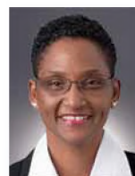
Angeleta Gray Commissioner, City of Delray Beach. Appointed by the Palm Beach County Commission, March 2013.