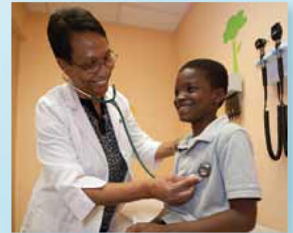
Pediatric examination at the C. L. Brumback Primary Care Clinic in West Palm Beach.

To make an appointment at any of the clinics, please call 561-642-1000.